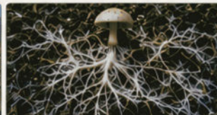
HEALTHY MYCELIUM NETWORKS