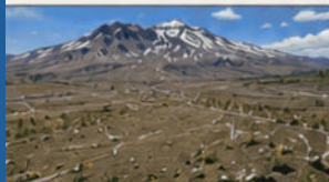
PUMICE PLAIN – SPARSELY FORESTED SOILS