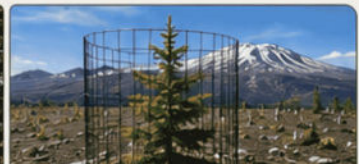
YOUNG TREES, STRONG FUTURE