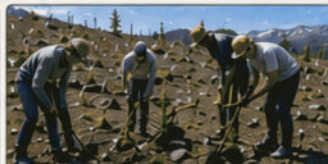
PLANTING IN VOLCANIC SOILS