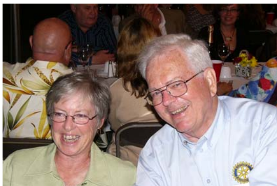
Ethiopia Dinner story continues on page 4